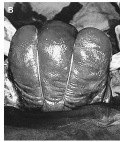
Figure 1. (A) Front view of the uterus, showing where the compression sutures are placed. (B) Intraoperative image showing the compression suture tied.